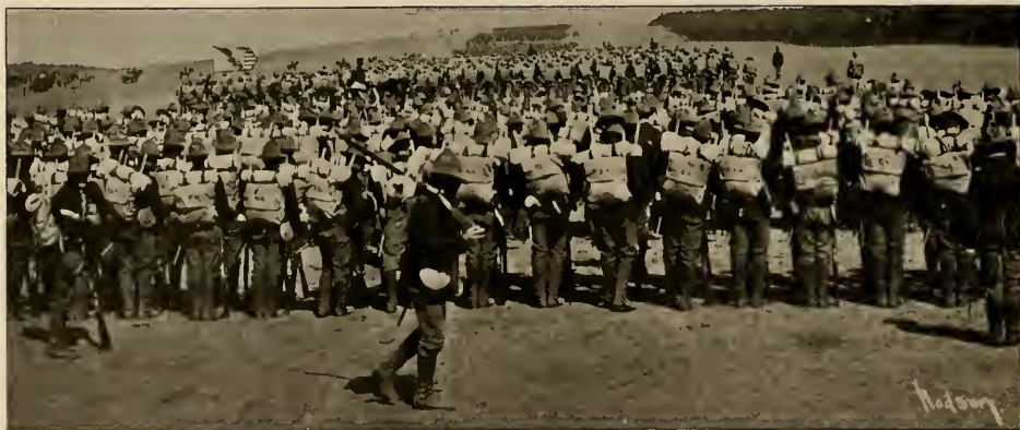
GENERAL MERRIAM REVIEWING THE KANSAS REGIMENT.